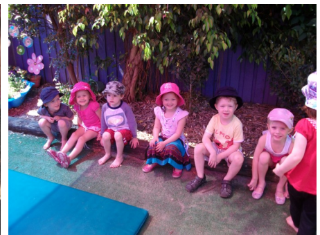
Waiting patiently for a turn on Preschools trampoline.