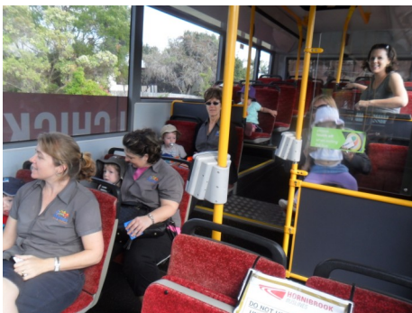
The Toddlers on our big adventure into Sandgate.

Another reminder that the centre is egg and nut free. The reason is that we have children that have severe allergic reactions to these products.