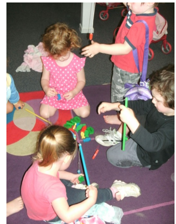
The Juniors have "gone fishin".