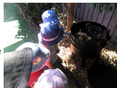
The Toddlers checking out our worm farm.