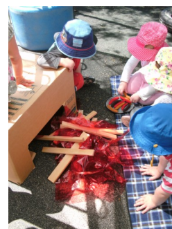
The Juniors having a bbq in the sun.