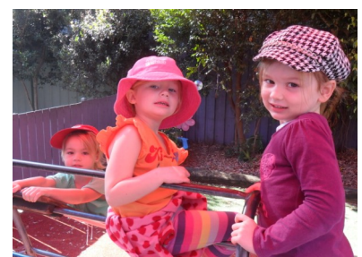
We love being outside.