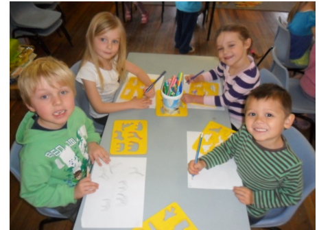
Ooey, gooey goop. Good clean fun.