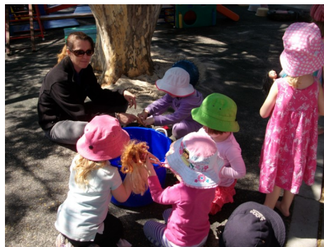
Kindy enjoying the beautiful weather.

We are trying to make our centre greener. The staff and children would appreciate any donations of pots, plants, plant cuttings, rocks of varying sizes, tree branches, stepping stones and anything else that would make us greener. Any suggestions of how we can achieve a greener centre would also be appreciated, some of us have green thumbs but we still could do with some help.